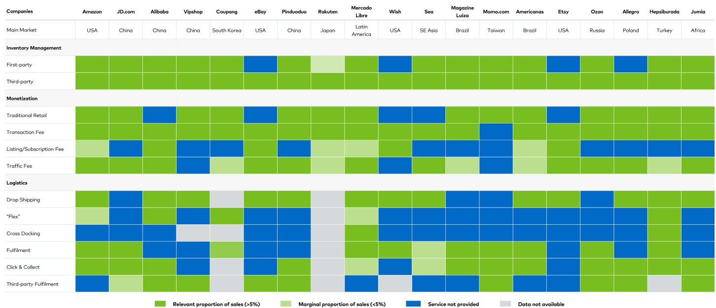
Figure 1: E-commerce business model heatmap